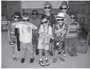
A group of campers having fun at Camp Courage 2008.