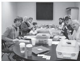
Volunteers at the first 2009 mailing party!