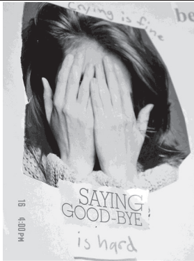
An excerpt from a collage that was done during an Annie's Hope support group.