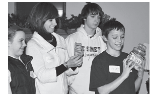
Attendees participating in a family activity at the 2008 Hope & Healing Gathering.

We thank all the families who attended the Hope and Healing Gathering. We hope your 2009 will bring you and your family peace, and renewal.