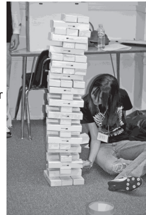
A teenager plays "emotional jenga", prompting her to think and talk about things she may have otherwise kept to herself.