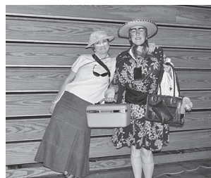
Trivia Night attendees were awarded prizes for their "tacky tourist" costumes.

On Saturday, March 7, Annie's Hope hosted its 11th annual Trivia Night and Silent Auction. The event was coordinated by the Junior Board (or "J Board" as they are often called) and was held at Bishop Dubourg High School. Over 350 people attended the event themed "Around the World". The theme was chosen to mirror this year's theme of