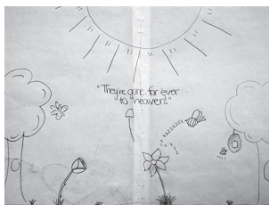
The above is a picture of the card made by a student in one of our School Support and Education support groups.

The Annie's Hope School Support & Education Program reaches out to grieving kids in the school setting, so that they are able to get the support they need that they otherwise would not receive.