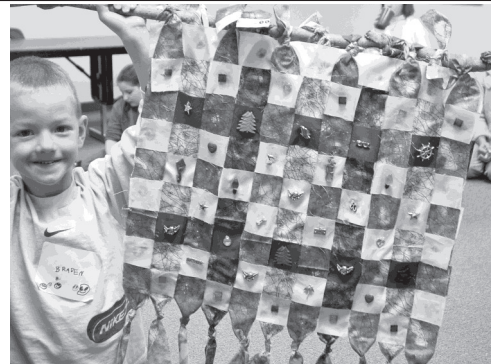
A grief tapestry shown by a child who is very proud of his work.